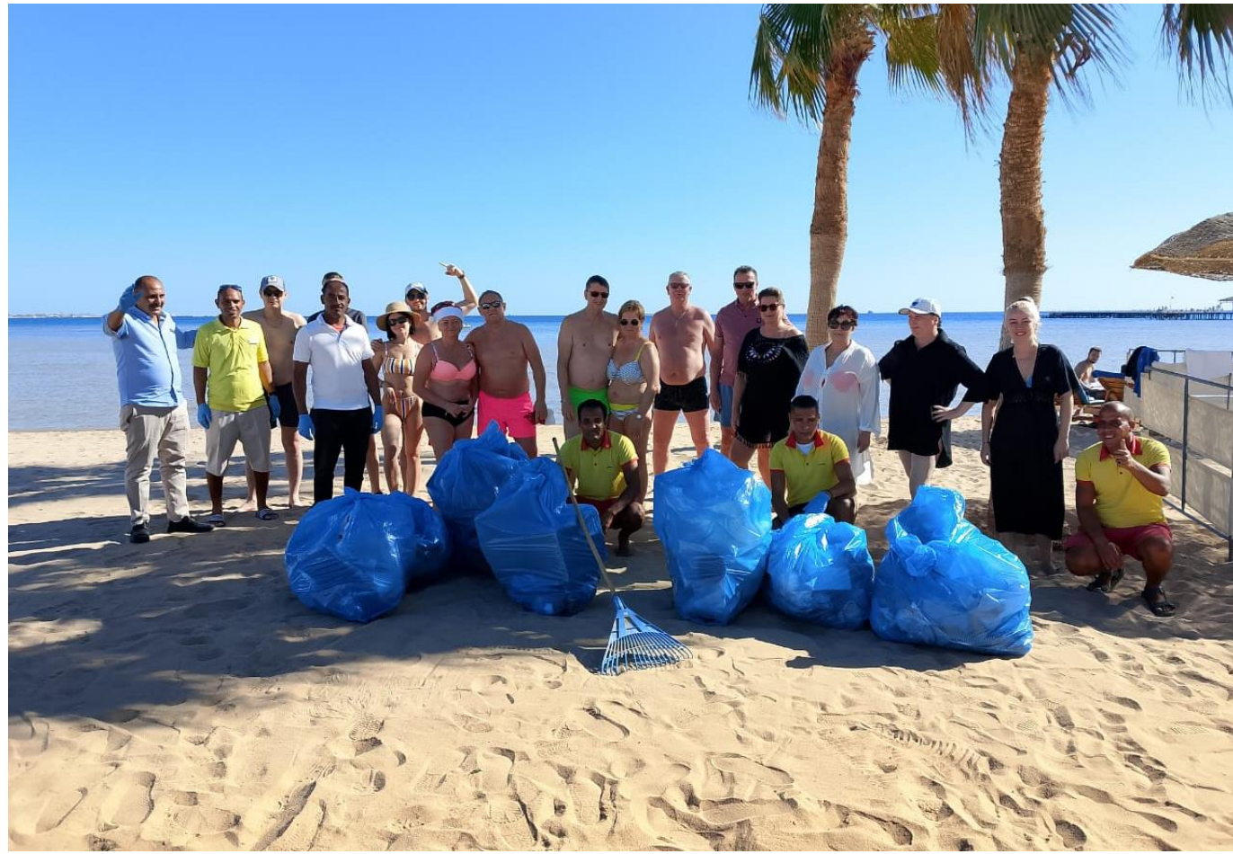
Regular beach cleaning activities