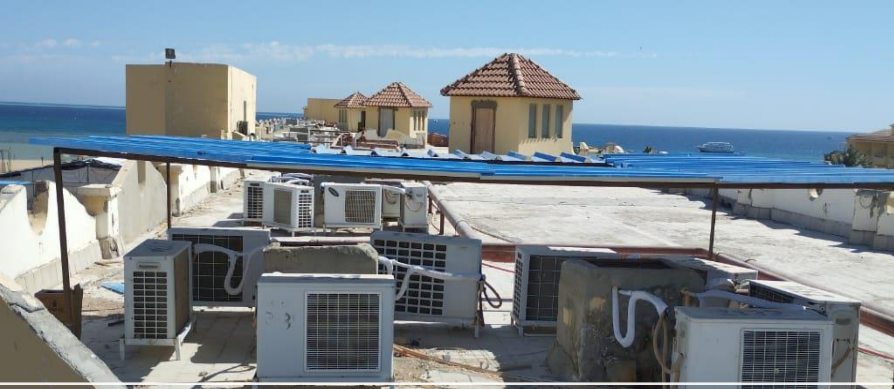
Shading hotel AC units