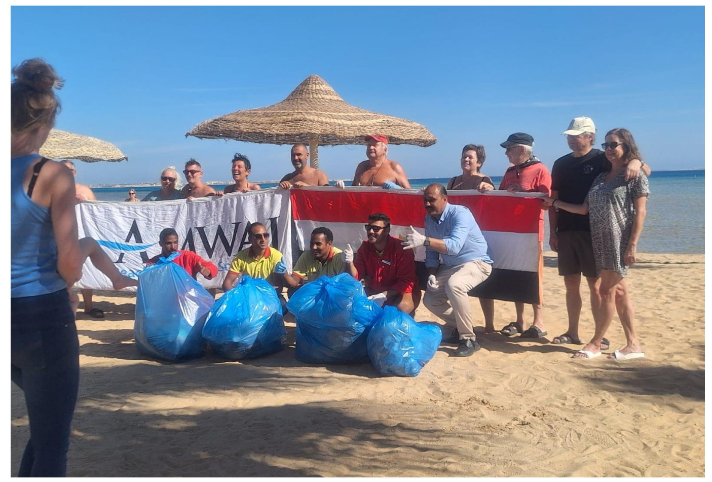
Beach and coral cleaning