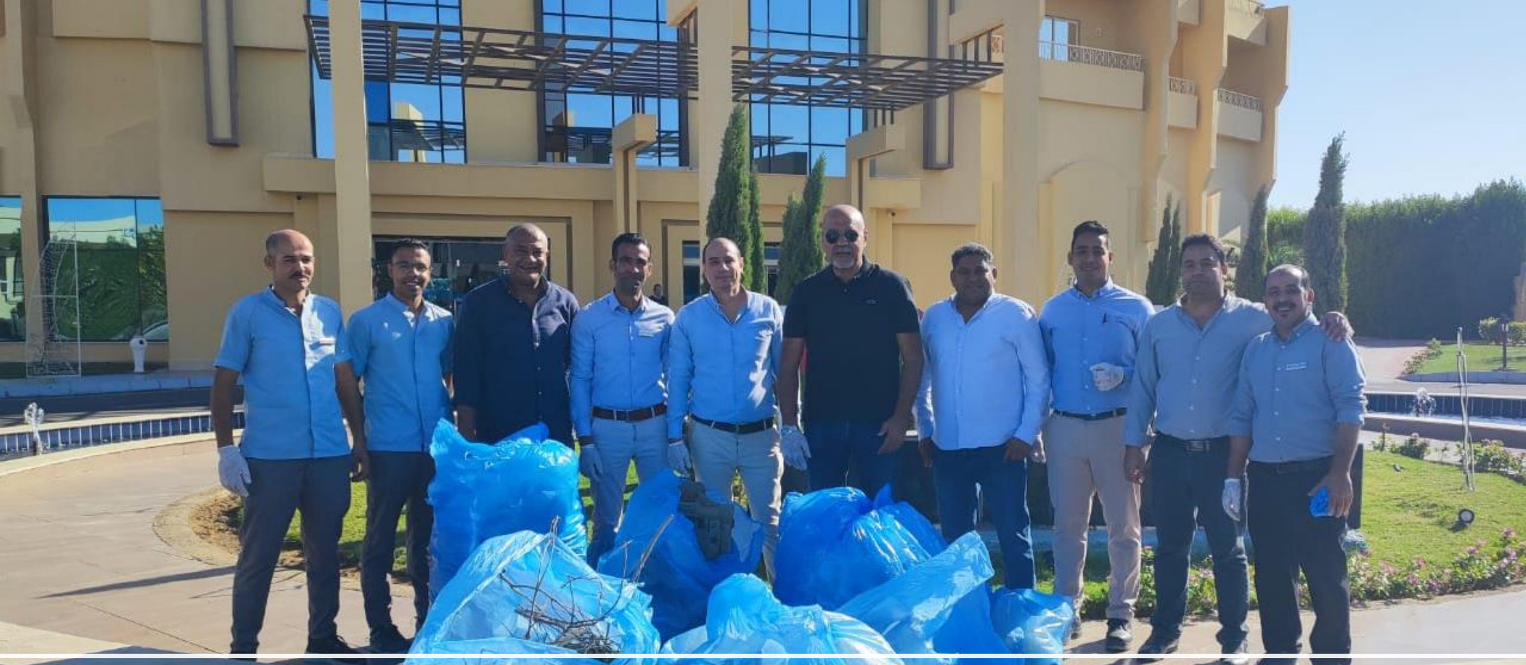
Clean up day